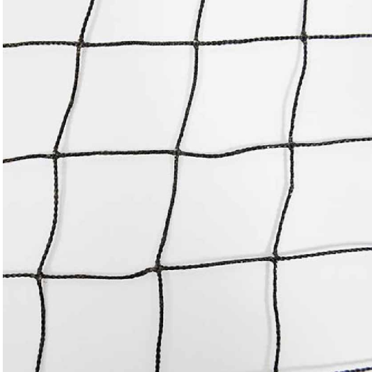
ULTRA CROSS® KNOTLESS DYNEEMA®