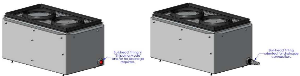
Diagram 2 Bulkhead fitting detail.